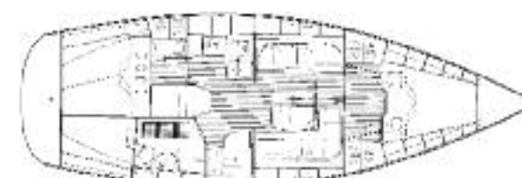
CRUISER 38 (2-cabin-version)