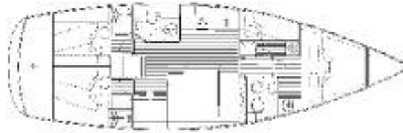
CRUISER 47 (4-cabin -version)